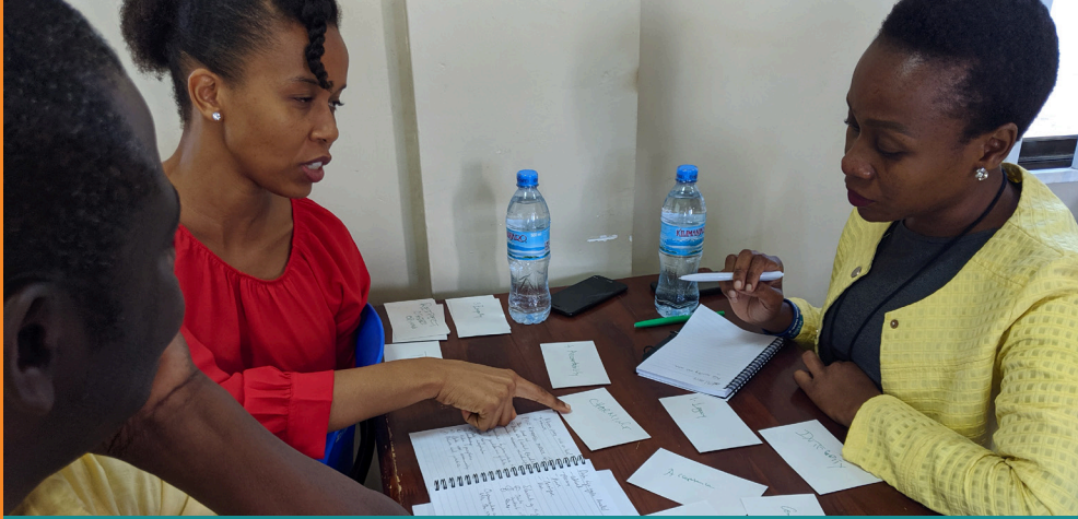
Participants from Tanzania's Ministry of Health deliberate how their personal values impact how they interpret and act on data about health sector investments.

Participants take an in-class or take-home exam which is graded by