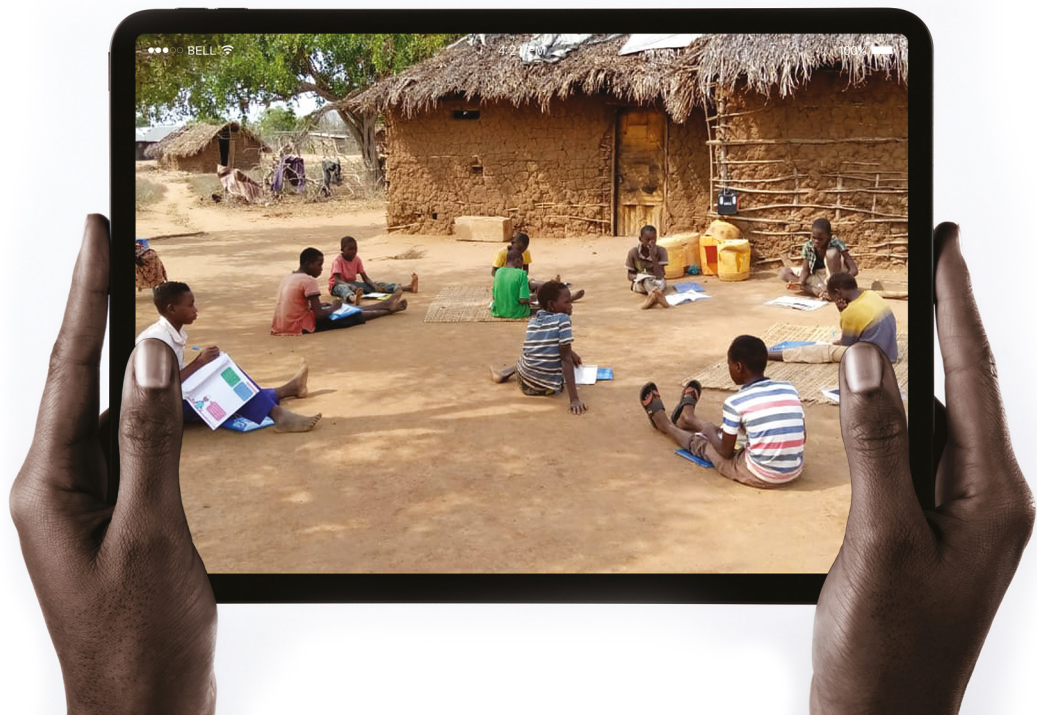
Radio Lessons in Tana Delta

During the unprecedented and difficult times of the pandemic, Zizi Afrique was able to reach 6,400 learners in ASAL counties through these low-tech distance learning modalities. The initial outcomes from this work are also promising: Learners who qualified for this intervention previously could read only a single sentence or word. For the 1,865 learners who attained the minimum 30 days intervention, 1,013 (54%) advanced (single or multiple levels) and could now read at least a paragraph. In numeracy, the proportion of learners struggling with complex subtraction reduced from 615 to only 269, with more learners progressing to higher levels like multiplication and division.